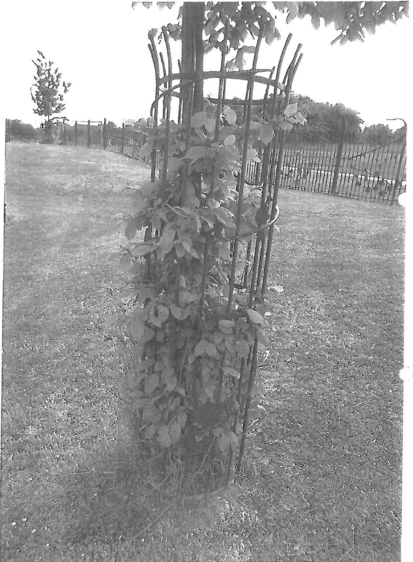
EXAMPLE OF DESIGN